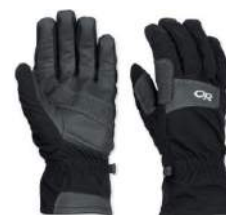
Outdoor Research Vert