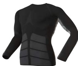
Odlo Crew-Neck Evolution Warm