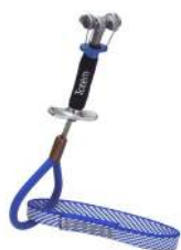
Totem Basic Cam