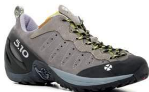
Five Ten Camp Four