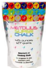
Metolius Superchalk 15oz