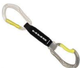
DMM Alpha Sport 12cm 5 Pack