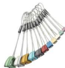
DMM Walnut Set 1-11