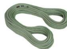
Mammut Galaxy Classic 10mm 50m