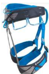
Black Diamond Aspect and Lotus