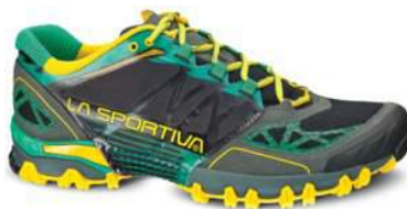
La Sportiva Bushido & Bushido Women's