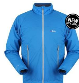
Rab Vapour-rise Lite Jacket