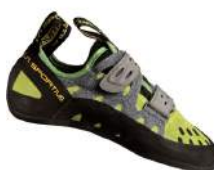
la Sportiva Tarantula