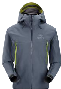
Arcteryx Beta LT Jacket Mens