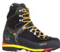
Salewa Blackbird Evo GTX