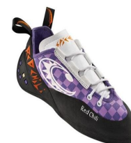
Red Chili Spice