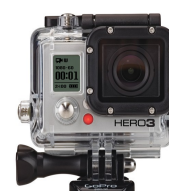
GoPro Hero3 Black and Surf