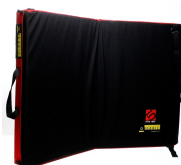
Five Ten Briefcase Pad