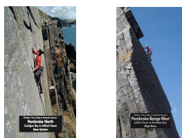
Pembroke Climbing guides