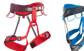
Black Diamond Aspect and Lotus