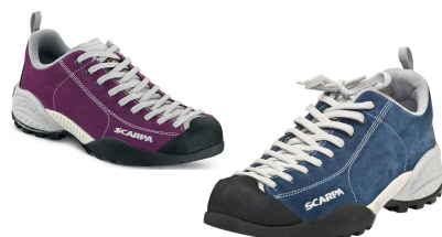
Scarpa Mojito and Mojito Lady