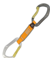
DMM Alpha Sport Quickdraw