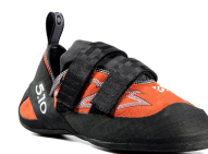
Five Ten Stonelands VCS