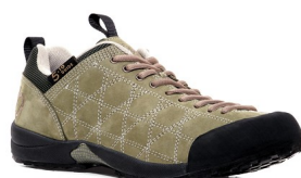
Five Ten Guide Tennie