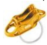
Petzl Reverso 4