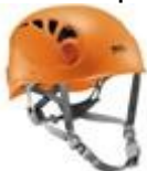
New Petzl Elios