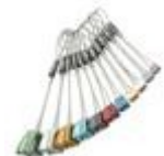
DMM Walnut Set