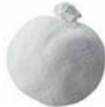
Bleaustone Chalk Ball